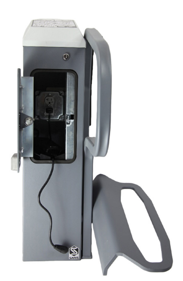
Secure charging locker includes automatic cooling fan and GFCI outlet (charger not included)

Downloadable product resources available online: